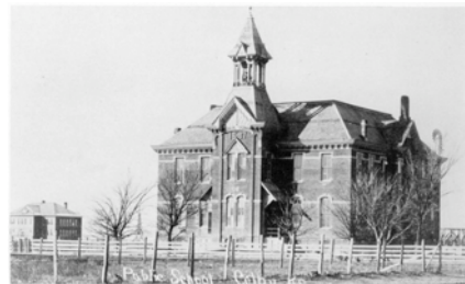
photo below.) It served as the high school until 1936. The building on South Range was eventually torn down to build the St. Thomas Hospital Building.

In 1887, having outgrown this building, the school was held in the upper room of the courthouse. A new school building was completed on the corner of 3 rd and Grant where the school complex is located today. When the 1887 building was outgrown a new Thomas County High School was built on South Range in 1907. (The 1907 building is to the left of